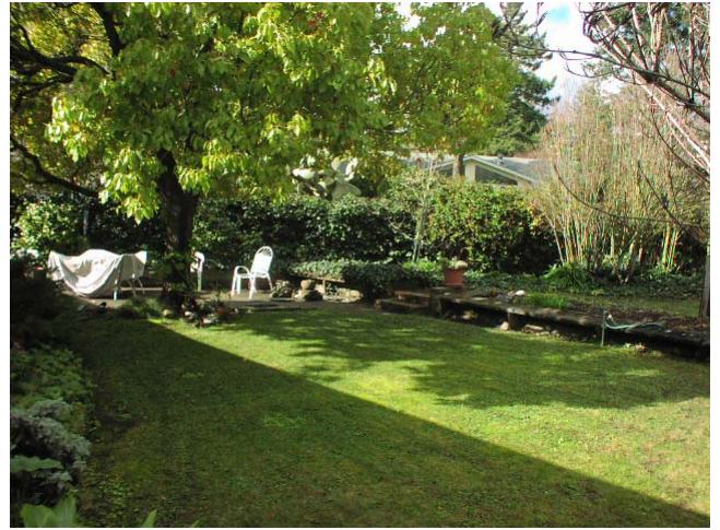
Private level fenced back yard...